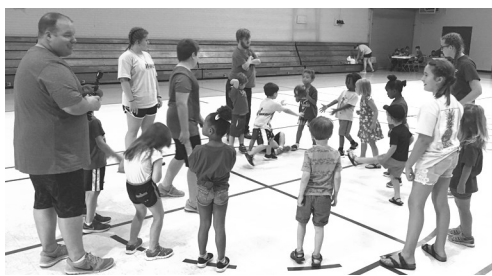
A group of children and adults having fun at Chickasaw Day Camp.