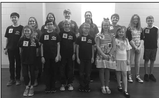
Participants in the 2019 Coffee Baptist Association Bible Drill.

May 14, 2019 at 7:00 p.m. Apologetics class